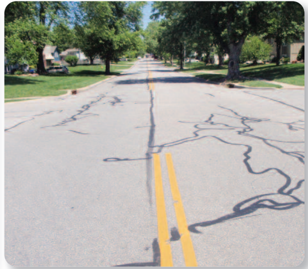
Montclair Drive Before 2017 Microsurface