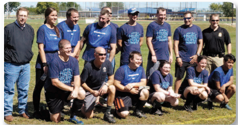
Copa Azul soccer team members

Each fall the Olathe Human Relations Commission celebrates Olathe Hispanic Heritage Month. In 2017, in partnership with the Olathe Latino Commission, a forum helped people become familiar with changes in immigration and addressed questions.