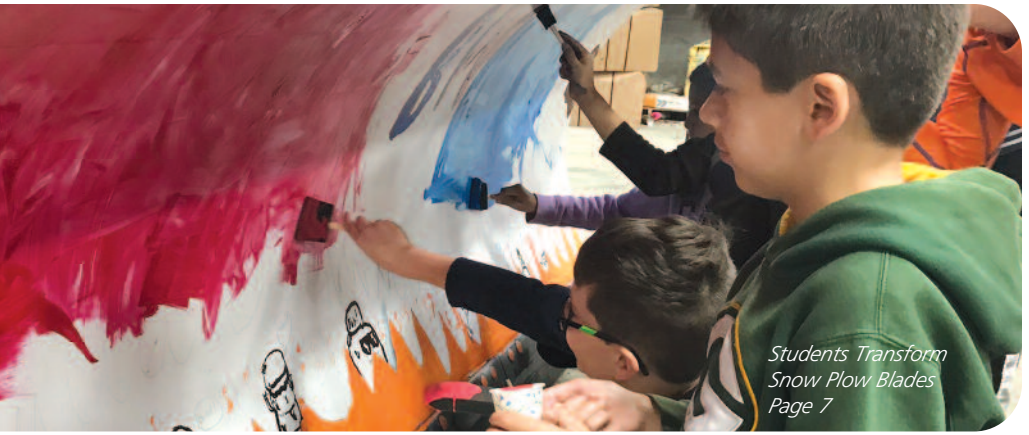
Students Transform Snow Plow Blades Page 7