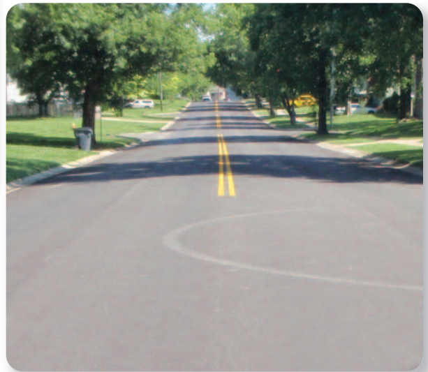
Montclair Drive After 2017 Microsurface