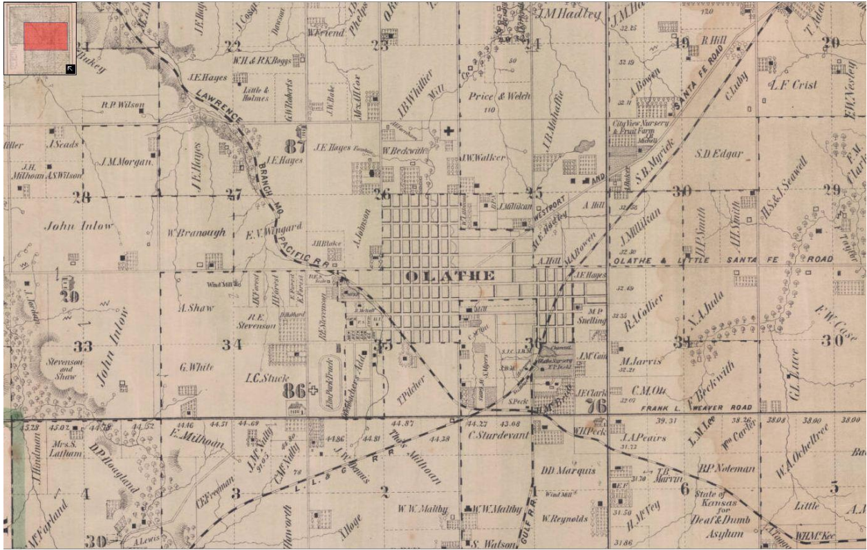
FIGURE 5 1874 ATLAS

Olathe grew in many ways after the Civil War. The growing community elected its first police, judge, and marshal in 1872. The Baptist Church of Olathe was founded in 1872, and a subscription library opened in the early 1870s. Agriculture provided income for nearly three-quarters of working adults in the county, and this segment of the population established the Olathe Grange in 1873. The Johnson County Cooperative Association opened a Grange Store in 1876. Located in a three-story building between Santa Fe and Park streets, just north of the buildings that would eventually become the Miller Building, the Grange Store served as the community gathering place until it burned in 1903. In the late 1870s, Isaac Pickering, a prosperous lawyer and mayor of Olathe, constructed his elaborate Italianate house at 507 West Park. 23