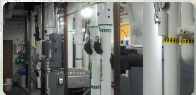
The mechanical equipment room supports correct environmental conditions for the new laboratory.