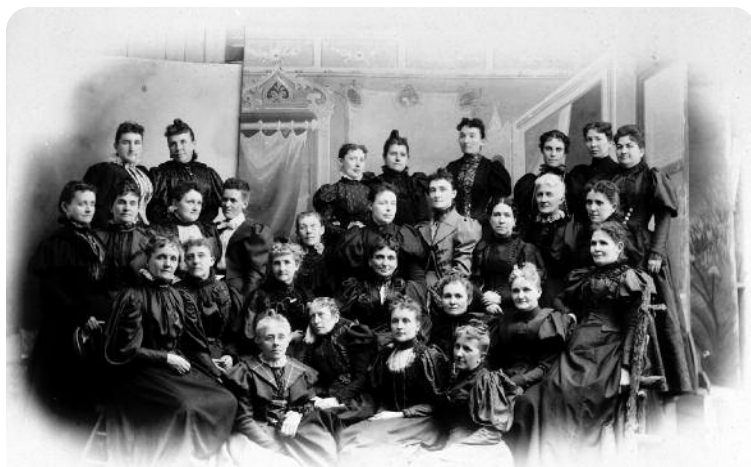
The Olathe Ladies Reading Circle was instrumental in starting Olathe's Public Library. The Ladies Reading Circle was the first federated women's club in Olathe, and the group remains active.