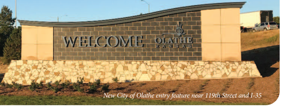
New City of Olathe entry feature near 119th Street and I-35