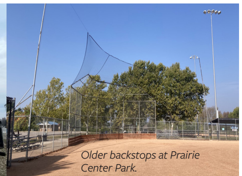
Older backstops at Prairie Center Park.