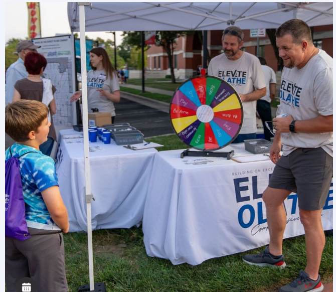
Visitors provided comments for the community's Elevate Olathe Comprehensive Plan at a Downtown Olathe Fourth Fridays event.

Are you interested in participating with your neighborhood or community group? Request a DIY workshop kit at 913-971-8750 or PlanningContact@OlatheKS.gov .