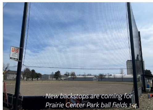
New backstops are coming for Prairie Center Park ball fields 1-4.