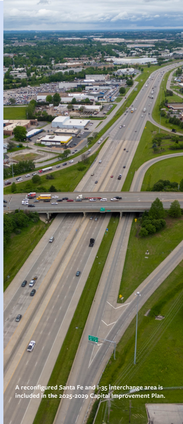
A reconfigured Santa Fe and I-35 interchange area is included in the 2025-2029 Capital Improvement Plan.