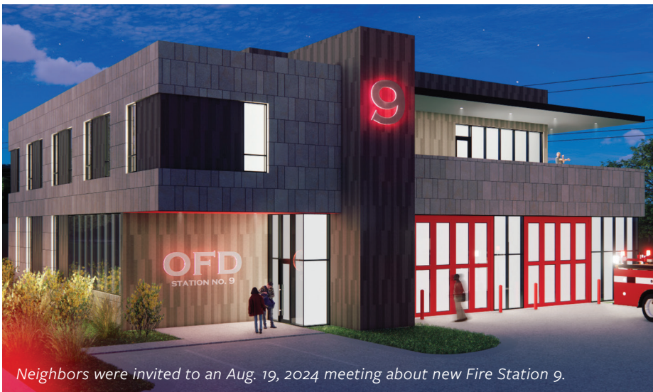
Neighbors were invited to an Aug. 19, 2024 meeting about new Fire Station 9.