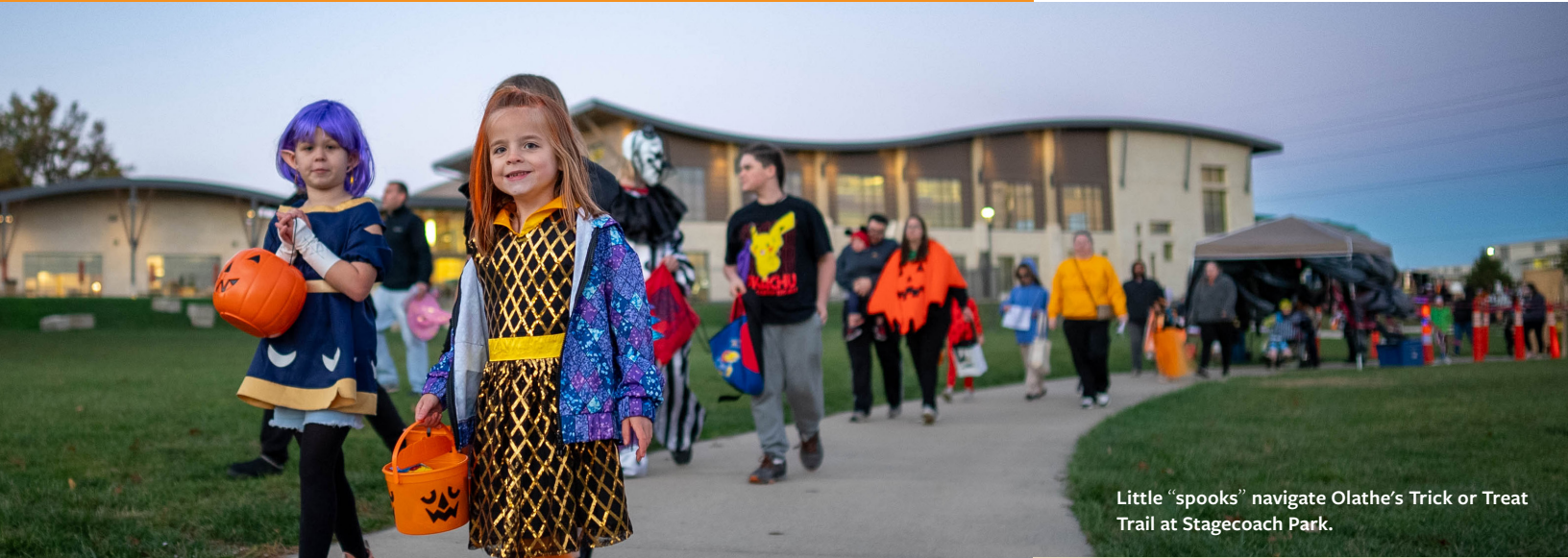
Little “spooks” navigate Olathe’s Trick or Treat Trail at Stagecoach Park.