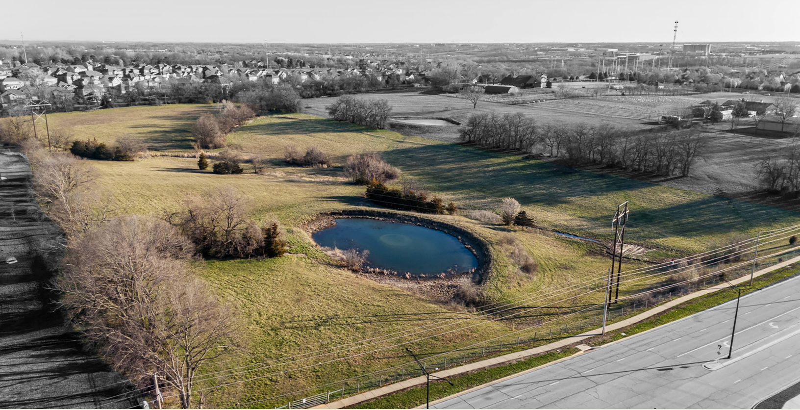
Future site of Pioneer Park