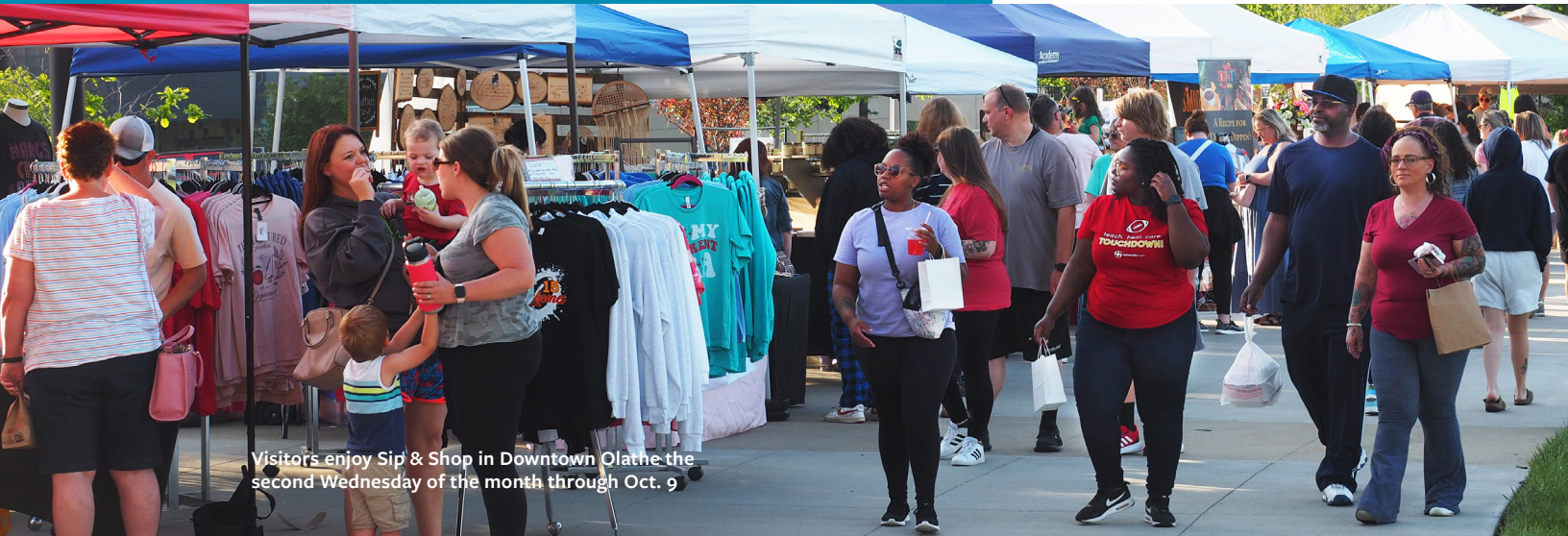
Visitors enjoy Sip & Shop in Downtown Olathe the second Wednesday of the month through Oct. 9