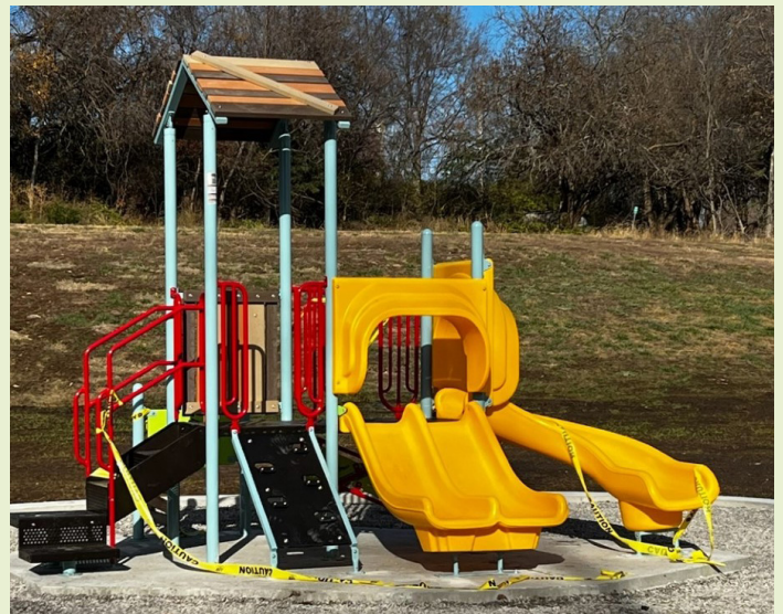
Children's play equipment at Loula Park (area still in construction)

Construction for improvements at Loula Park, 1300 W. Loula St., is now underway. This four-acre park will offer a small children's playground, shelter, drinking fountain, and landscaping. It will also have a bike repair station equipped with tools. A path connects Loula Park to the Rolling Ridge Trail.