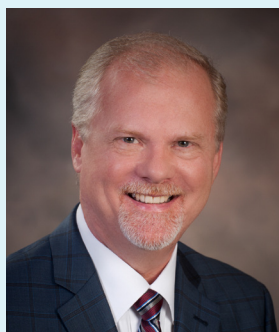
John Bacon Mayor

Olathe City Council elections occur in odd numbered years with elected City Councilmembers to serve four-year, staggered terms.