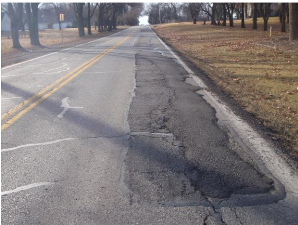
Quivira Road Before