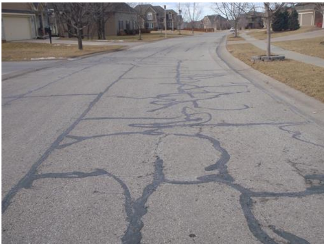
West 156th Street Before