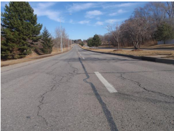
Kansas Avenue Before