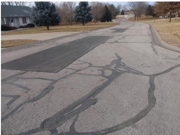
West 117 th Terrace Before