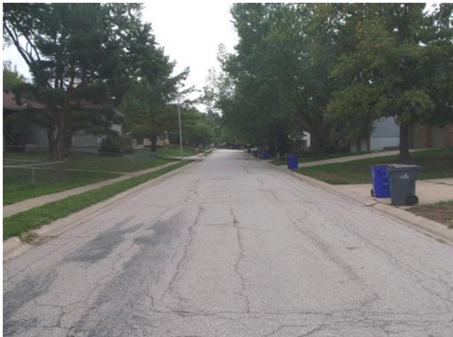
Summertree Lane Before