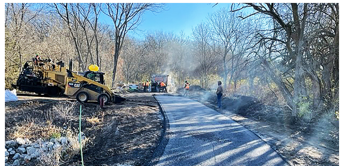
Crews install pavement on the Cedar Creek Trail's first phase in west Olathe.