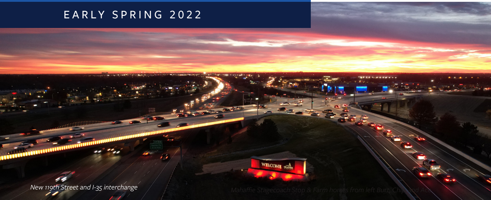
New 119th Street and I-35 interchange