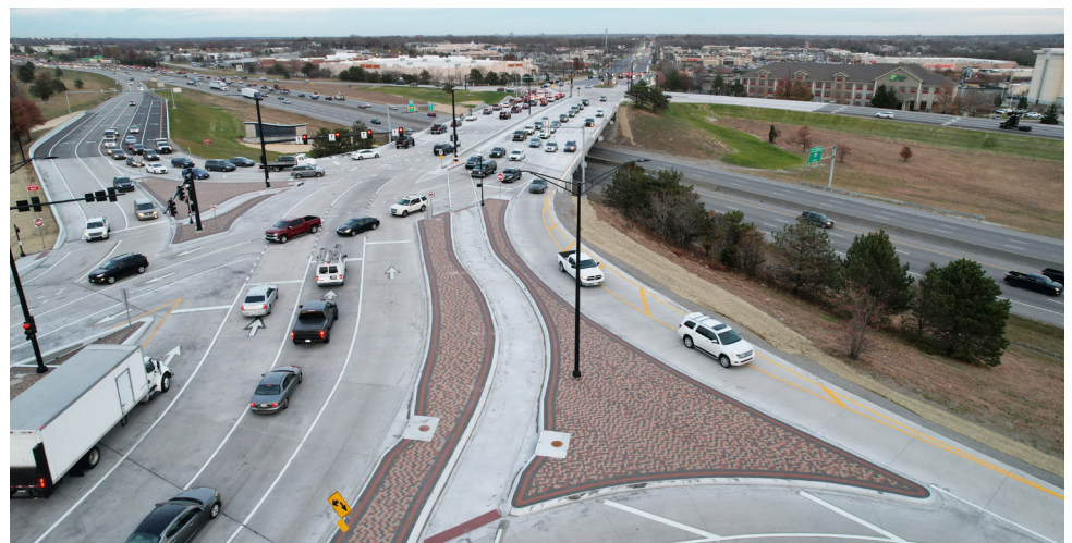
The new 119th Street and I-35 interchange is better moving traffic with its reconfiguration and additional lanes. Traffic data shows morning peak hour delays reduced by 20 to 40 percent and evening peak hour delays reduced by 7 to 27 percent.