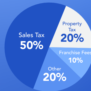
REVENUES BY CATEGORY

The general fund is the City's main operating budget that includes administration, information technology, human resources, finance, and communication