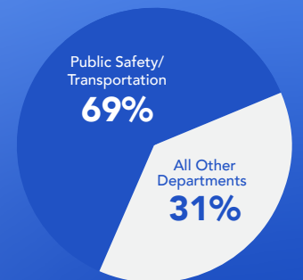
FOCUSING ON YOUR PRIORITIES

The proposed budget and other financial information is available at OlatheKS.org .