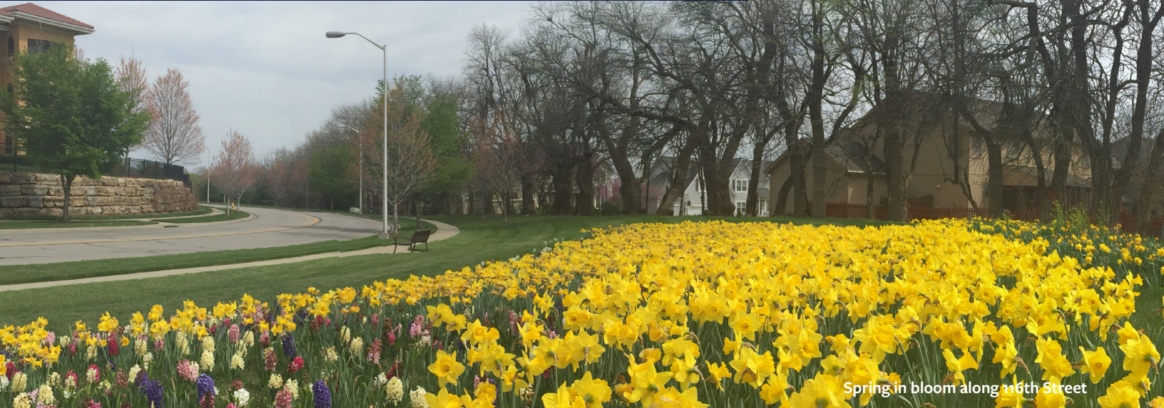
Spring in bloom along 116th Street