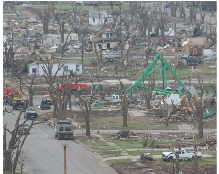
Photos: aftermath of Greensburg, Kans. tornado, May 2007

The National Weather Service issues a tornado watch when weather conditions in an area indicate an increased risk for severe weather that may be capable of producing a tornado. Warnings are issued when a tornado has been sighted or indicated by weather radar. Plan before a watch or warning is issued.