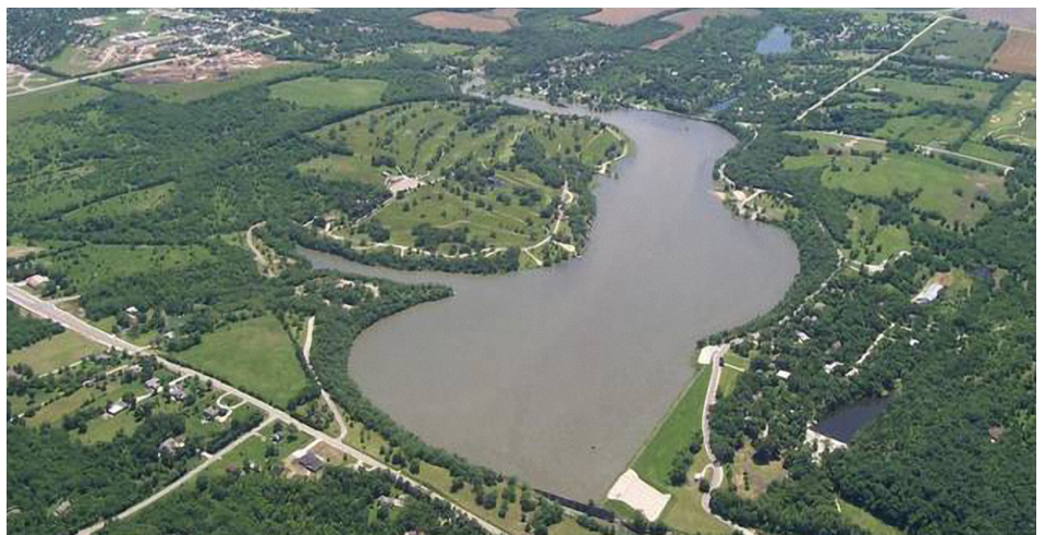
Top photo: Lake Olathe and surrounding area, late 1950s