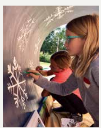
Prairie Center Elementary