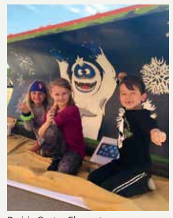
Prairie Center Elementary