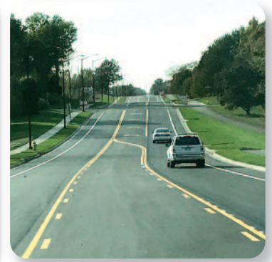
143rd Street, between Pflumm and Quivira recently received major improvements.

We have a design ready for improving traffic flow at the 119th Street and I-35 Interchange , including improvements for the 119th Street corridor from Strang Line to Renner Road . The City of Olathe is seeking federal and state funding assistance for the $28 million interchange project.