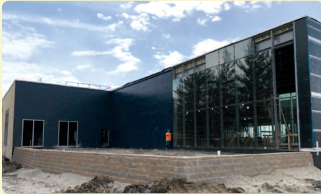
The Children's Reading Garden is coming together on the building's northeast side. A security fence will be installed at the area's retaining wall to protect young library patrons.