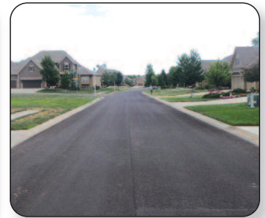
Marais Drive After