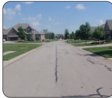
Marais Drive Before