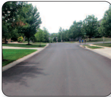
164th Street After