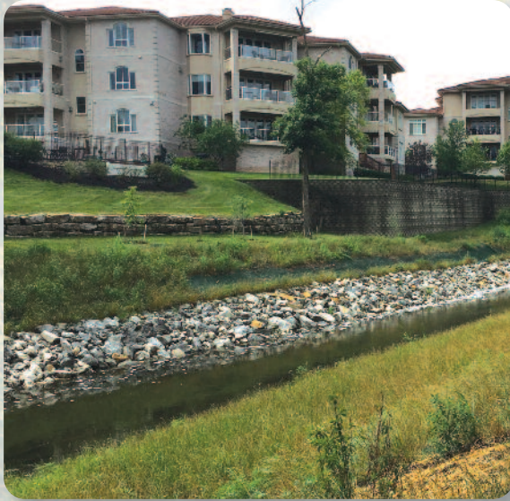
In 2018, stormwater funds were invested in the stream bank stabilization project on Indian Creek, Albervan to Pflumm.