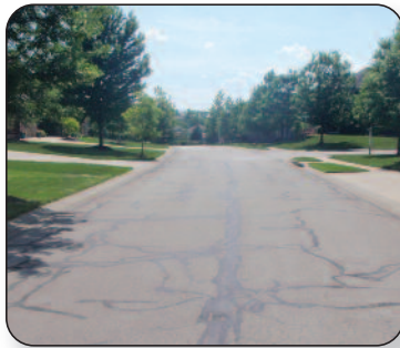
164th Street Before