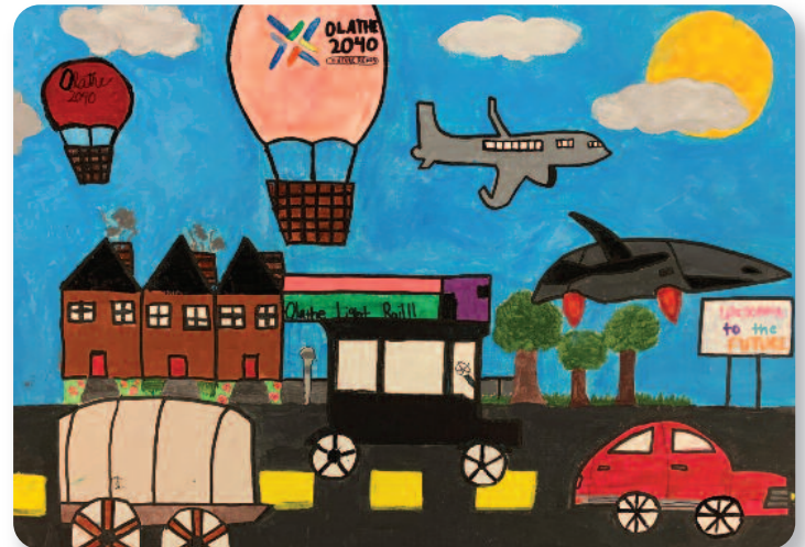
Olathe 2040: Future Ready Art Challenge student entry. See more art on page 8.

The Olathe Strategic Planning Advisory Committee presented a Vision Framework to the City Council in December for their comments. The final Olathe 2040 Strategic Plan is expected this summer.