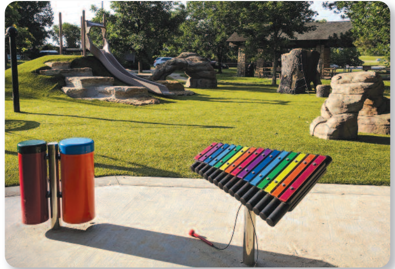
Fun awaits at the new Frisco Lake Park nature playground.

This year, we can look forward to more opportunities for an active lifestyle through new park facilities. Enjoy the new, 4.5-mile Meadow Lane Trail or the new nature playground at Frisco Lake Park. Many exciting improvements are on schedule to open this summer at Lake Olathe. In addition, new amenities will serve Lone Elm Park users, and a new park will open in the Woodland Hills Reserve neighborhood. A beautiful and innovative new Indian Creek Library will