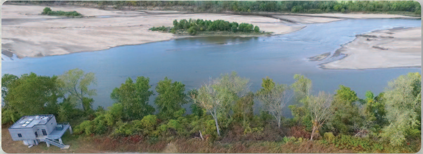
Collector wells along the Kansas River provide the City of Olathe's source for drinking water.