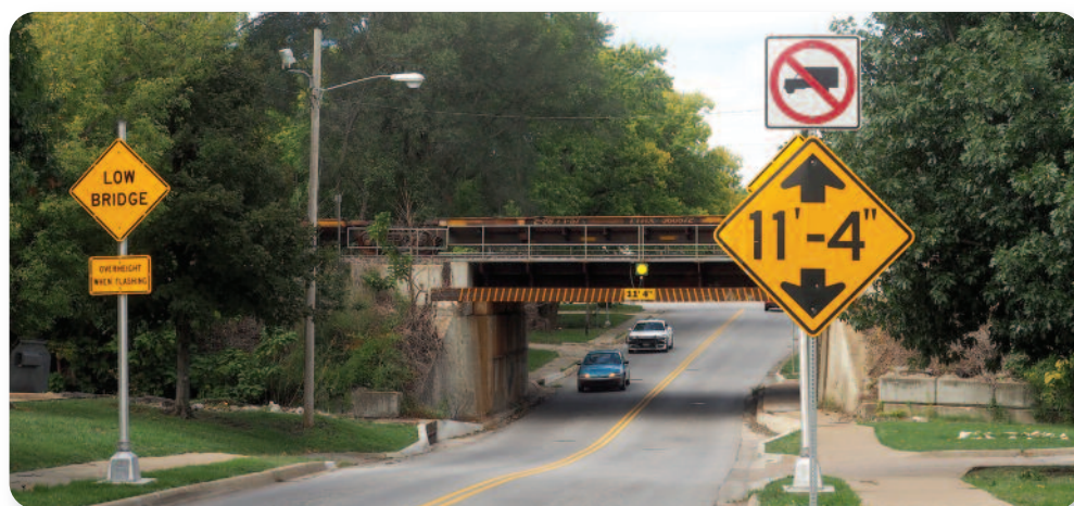
The Spruce Street and BNSF bridge low clearance warning system is operational for both westbound and eastbound Spruce Street. Low bridge warning signs will only flash when the infrared beam is broken by a vehicle taller than 11 feet 4 inches.

Drivers of vehicles taller than 11 feet-4 inches now get a different type of warning should their vehicles exceed the clearance for the Burlington Northern Santa Fe (BNSF) bridge on Spruce Street. Newly-installed transmitters create infrared beams over Spruce Street on both the east and west sides of the BNSF bridge. When an over height vehicle breaks the infrared beam, a flashing warning sign activates via a wireless signal, notifying the driver that their vehicle won't clear the structure ahead. The railroad bridge over Spruce Street has a history of vehicles colliding with the structure.